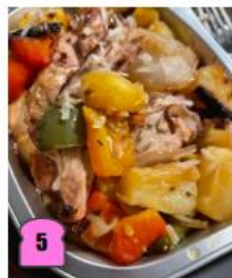
5 Hawaiian Chicken Sugar Cookie