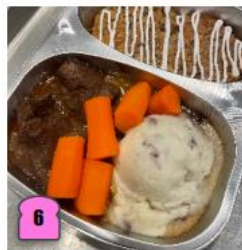
6 Pot Roast-Carrots-Potatoes Oatmeal-Raisin Cookie Bar