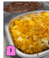
7 Steak, Eggs & Pepper Jack Casserole/Chocolate Muffin

1. Spaghetti Squash Alfredo Bake/Garlic Bread $16 - (vegetarian) Roasted spaghetti squash with spinach & Alfredo sauce, topped with mozzarella cheese. Includes slice of homemade bread with mild garlic butter.