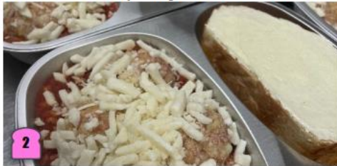
2 Chicken Parmesan Meatballs Garlic Bread