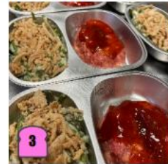
3 Timber's Meatloaf Green Bean Casserole