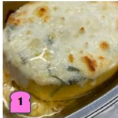
1 Spaghetti Squash Alfredo Bake Garlic Bread

Email orders to rachel@rachskitchen.com , Facebook message or call 319-827-2165 by Sept. 10th to ensure selection.