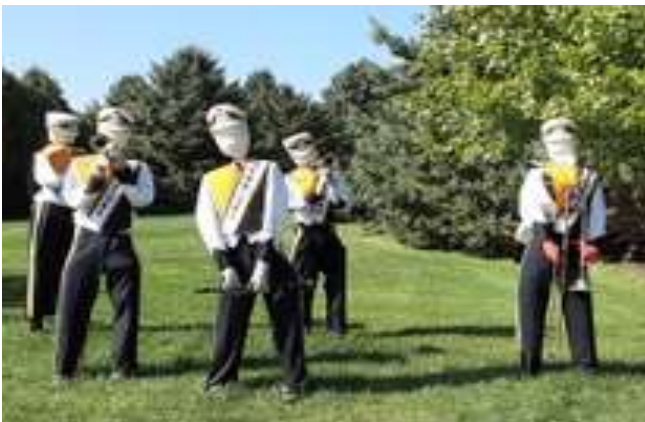
A Band of Scarecrows