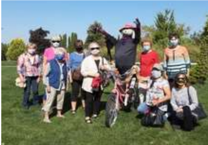
Women in Motion Admire This Not-at-all Scary Figure

Women in Motion (WIM) visited the Cedar Valley Arboretum and Botanic Gardens on Friday, September 25. (Some met at Ardelle's garage to enjoy Fourth Friday With Friends before carpooling to the Arboretum.) Entry to the Arboretum grounds was only $5. The Scarecrow Stroll included a competition; each visitor received a ticket and could vote for a favorite among the figures set up by Cedar Valley organizations. (Anyone interested in creating an AAUW CFW scarecrow next year should contact WIM. Scarecrows need to survive the elements for about six weeks.) Other scarecrows, like the wild-socked bicyclist in the photo below, were set up by Arboretum staff and volunteers.