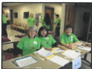
our fabulous volunteers!