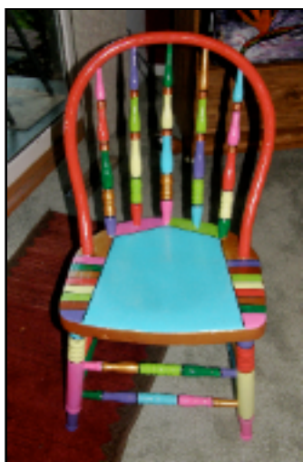
Acrylic painted chair for use indoors or in a sheltered outside area - Minimum $35.00