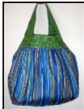
Hand constructed blue striped bag with inside pockets, approximately 18 x 20" + handle Minimum- $45.00