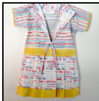
"Dick and Jane" clothespin bag - Minimum $15.00