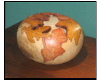
Hand crafted and painted gourd bowl with leaves, approximately 8" diameter. Minimum $20.00