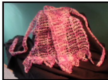
Hand crocheted, lavender fancy apron - Minimum $15.00