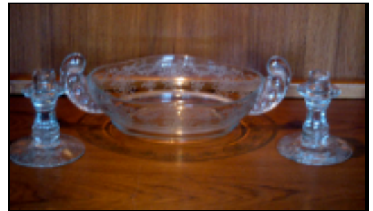
Three piece 1940's buffet glassware set with oblong bowl, approximately 8" x 13" and two candleholders. Minimum $30.00