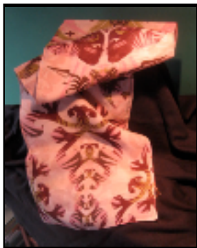
"Symbols of the Warrior", dusty rose scarf, 9" x 54" - Minimum $10.00