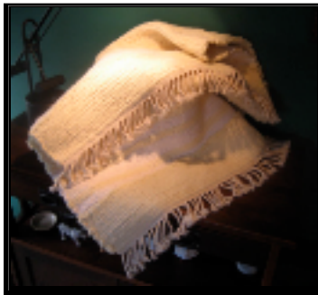
Woven chenille rug, 26" x 41" cream with light yellow; washable. Minimum $15.00