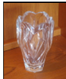
"Sweet Memories", 6.5" Waterford lead crystal vase Minimum bid $15.00